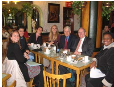
Participants from the 10 th annual International Service Learning Conference

http://www.icicp.org/index.php?tg=fileman&idx=get&inl=1&id=17&gr=Y&path=&file=Talloires.pdf