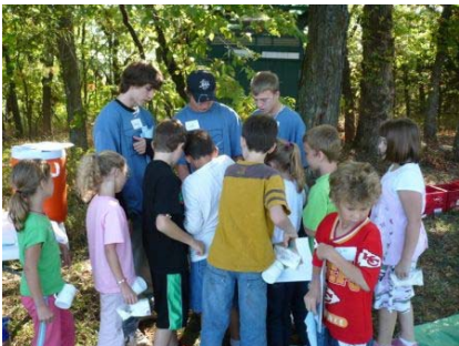
Students from John Dewy Learning Academy teach local elementary students about the importance of water in the environment.