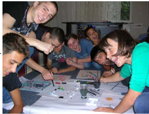
Youth at an IMPACT meeting in Bucharest, part of the New Horizons Foundation's program to increase youth service in Romania.

As of September 2007, New Horizons Foundation opened 29 IMPACT clubs (450 kids involved) that implemented 120 service projects with 19200 direct beneficiaries in 9 counties in Romania. NHF reported a future sustainability rate for these clubs of 85%, which is very high for the country and illustrates that the programs will continue to have a broad impact in the coming years. Additionally, NHF was approached to consult with the Ministry of Education and Research to grow the service learning movement in Romania through the scholar system. To facilitate this partnership with Ministry of Education and Research, NHF opened an office in Bucharest.